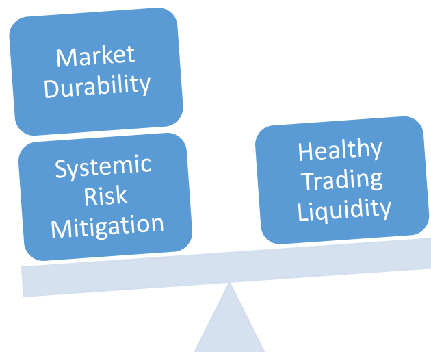
Figure 4: US Swaps Regulation 2.0 Balance Needed to Achieve Broad- Based Economic Growth and Revival