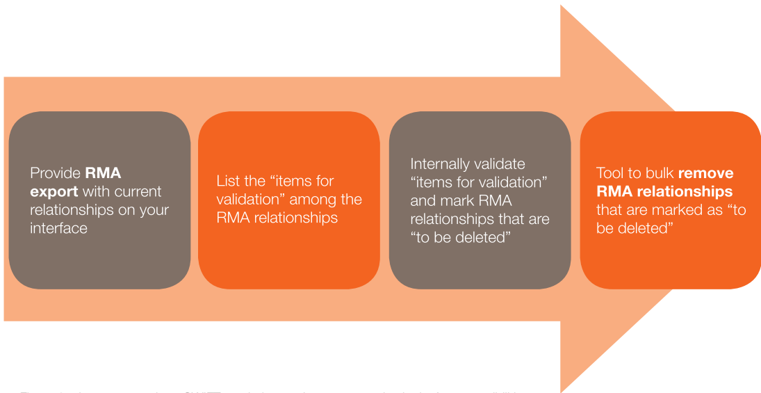
▲ Figure 3 – In orange = where SWIFT can help you. In grey = your institution's responsibilities