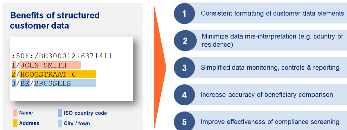
Illustration 3 – Benefits of structured customer data in payments messages

As of November 2020, the SWIFT Release will remove free-format options in fields 50a (Ordering Customer) and 59a (Beneficiary Customer) from the MT103 and related messages to ensure that originator and beneficiary data is captured, processed and transported in a structured format. This implies important work to prepare for the change. Doing nothing is not an option and the sooner the information is structured the better. This will produce benefits in terms of operational speed and reduced compliance costs.